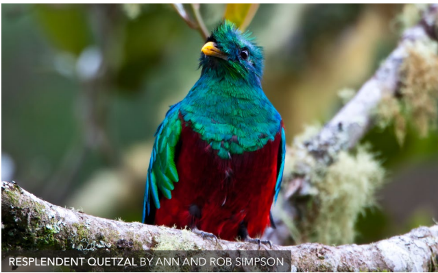
RESPLENDENT QUETZAL