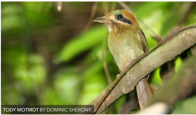
TODY MOTMOT

see some new species. If lucky, you may find the uncommon Slender Sheartail hummingbird or Prevost's Ground-Sparrow. Santiago de Atitlán is a hub of Maya culture and there may be an opportunity to meet some locals who are part of the Audubon bird tourism initiative. National Audubon has partnered with Asociación Vivamos Mejor (AVM), a private nonprofit development organization committed to improving the quality of life of rural communities surrounding Lake Atitlán. AVM focuses on sustainable watersheds and resiliency to climate change as a strategy for promoting sustainable development. Along with your primary group leader, each location will have a local guide involved in the project. Overnight at Hotel Bambú. (BLD)